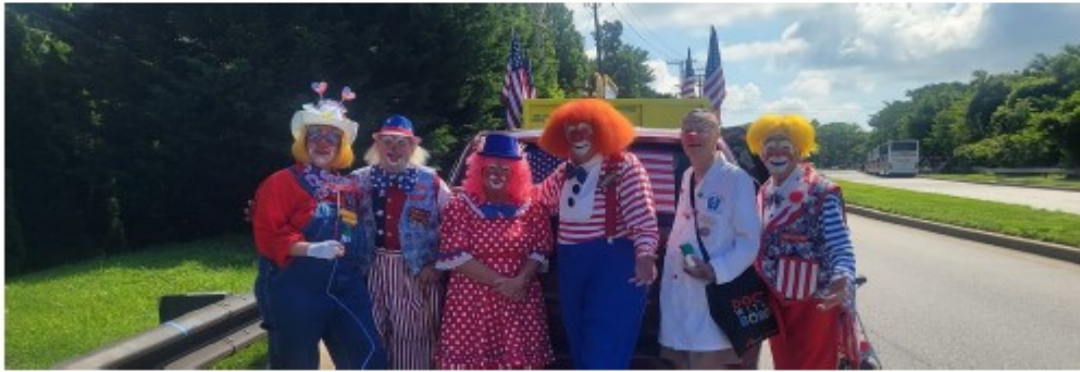
4th of July Parade—Towson, MD